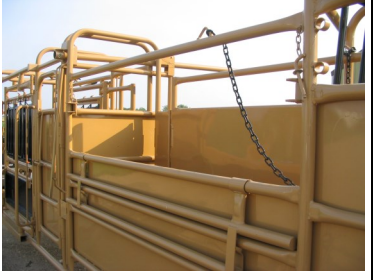
Drop Down Alley Access

Tests at Texas A & M have shown C&S Beige is the best color for working cattle. It has a calming effect on the animals and they flow better.